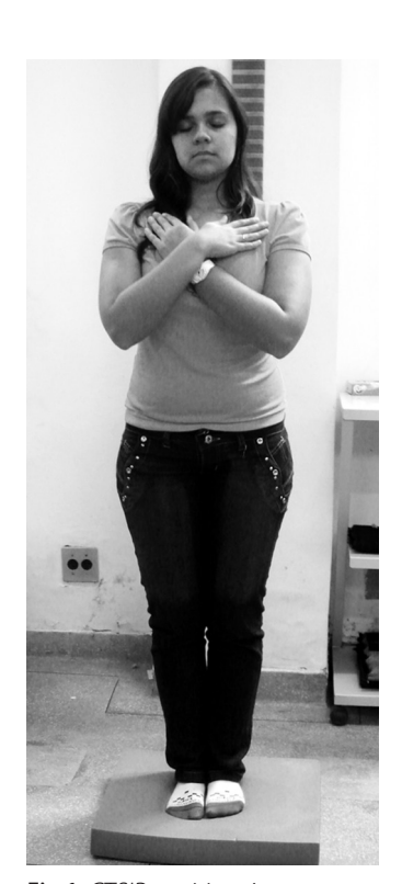
Fig 1. CTSIB position 4.

In the original description the examinee was tested in six positions, two of them with visual conflict ^{24} . The